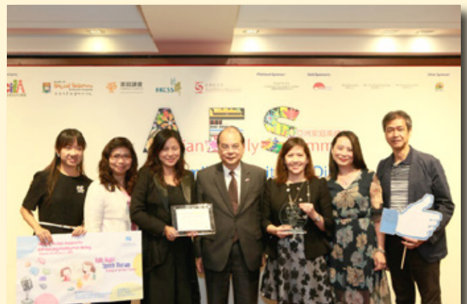
Award Presentation Ceremony